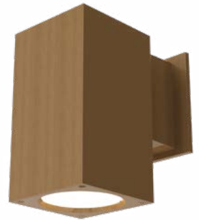
Wood Grain Finish

Special Finishes Available. Contact our sales department.