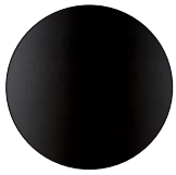
Matte Black (MB)