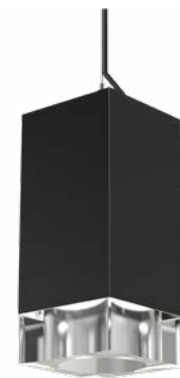
Click for Spec Sheets